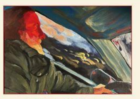
SD43 Grade 12 Art Students

On view at Place des Arts: January 19 - March 14, 2024 Online at placedesarts.ca: January 26 - March 14, 2024 Opening Reception: Friday, January 19, 7:00 - 9:00 PM