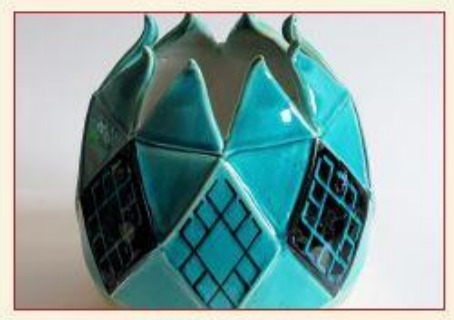
Azadeh Mehryar Diaspora Ceramics in the Link Image: Nomadic [detail]

Fragile Stories: Encaustic Portraits Encaustic and carved wood in the Leonore Peyton Salon Image: Raven in Flight [Detail]